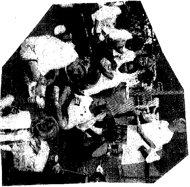
Juniors enjoying Noah's Bogale at their Saturday morning clinic, July 15.