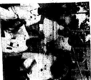
With some of the Venice Boys & Girls, July 15.

We offer group lessons and clinics in Southern California but is it sufficient? Is teaching available at every facility? Are we promoting proper use of the rules and sportsmanship? Why aren't more kids playing?